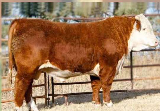
MH Rambo 0215 - BD: 4-17-10

UPS Domino 2110 UPS Miss Domino 5614 UPS Miss Advance 2601