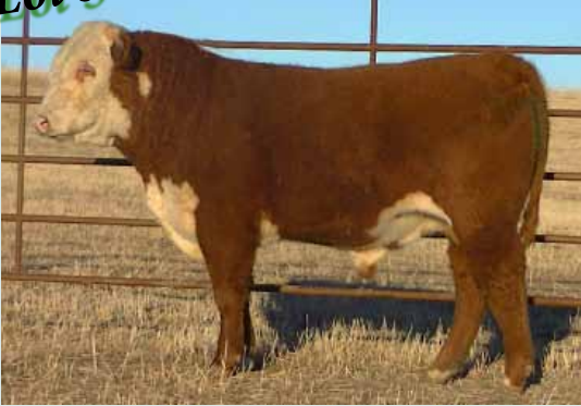
HH Beef Time 1276 - BD: 9-17-12