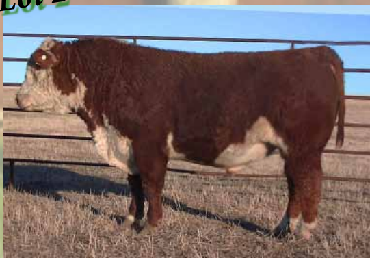
HH Knight Time 1233 - BD: 3-14-12