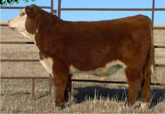
HH Domino Bandit - BD: 2-15-13