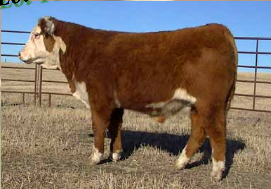
HH Knight Bandit 1325 - BD: 2-15-13