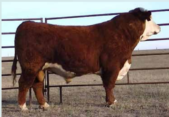
UPS About Time 0138 - BD: 3-18-10

A truly amazing sire out of the popular About Time 743. Our top pick purchased from the Upstream Ranch. This bull puts a stamp of functional correctness, depth and eye appeal in every calf. There are several calves in the sale out of this bull.