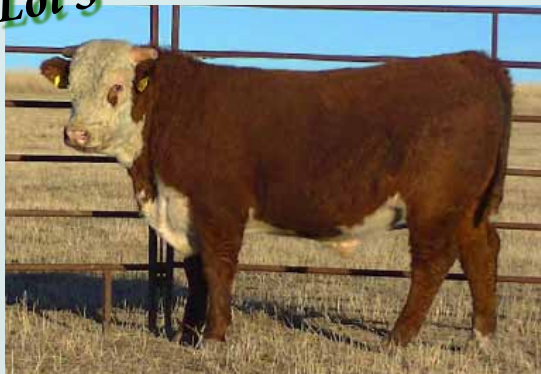
HH Beef Time 1266 - BD: 9-10-12