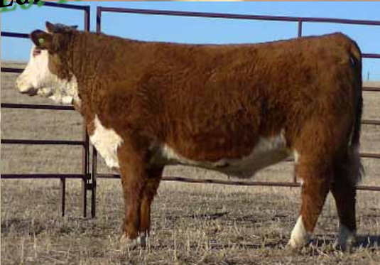
HH Angler 1312ET - BD: 2-6-13