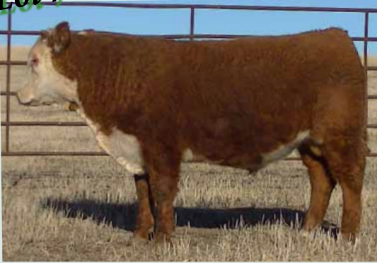
HH Angler 1303 ET - BD: 2-1-13