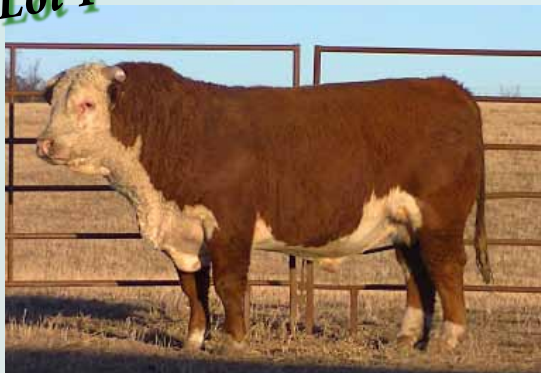
HH MR DOM BEEF 1163 - BD: 9-11-11