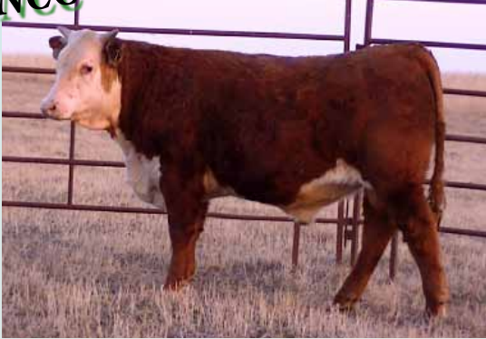
HH Angler 1308ET - BD: 2-4-13