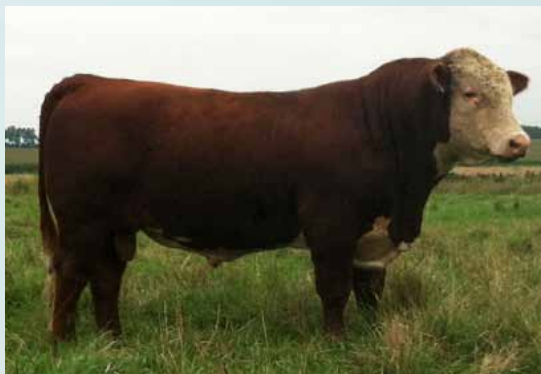
HH Little Casino 1111 - BD: 2-14-11

Very proud of this own raised heifer bull sire. We looked far and wide to find a bull that would work on heifers and still hold the performance numbers together and determined the best out there was in our own pasture. Even more impressive than the bulls out of this sire are his daughters. He produced the top daughter in this calf crop and we've already sold other show heifers out of him. Dams of the future are his calling. Daughters out of his sire have been excellent in maternal traits, and he is proving to do the same.