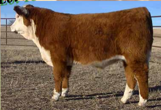
HH Rambo Patriot 1350 - BD: 4-24-13