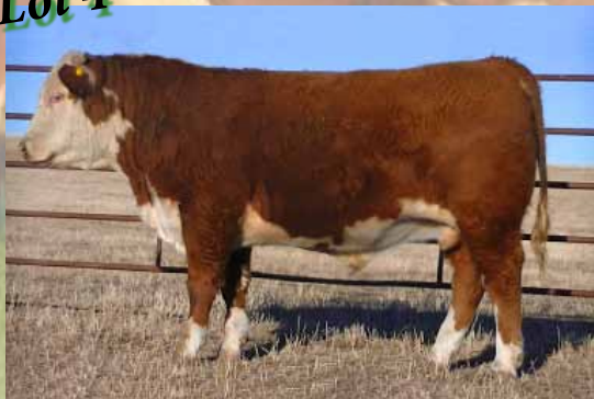
HH Beef Time 1272 - BD: 9-16-12