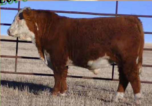
HH Sparty Navarro 1286 - BD: 11-4-12