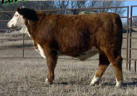
HH Harland 1305 - BD: 2-3-13