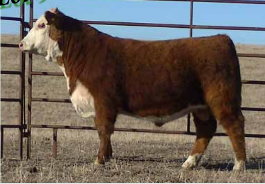
HH Harland Time 1313 - BD: 2-6-13