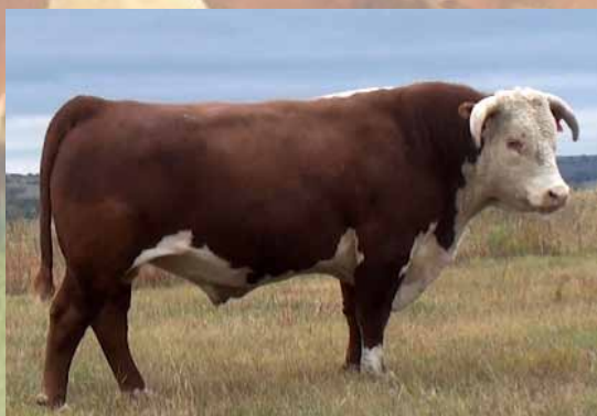
CL 1 Domino 0145X - BD: 1-31-10

JBN L1 Domino 508 HH Miss Domino 842 UPS Miss Domino 6427