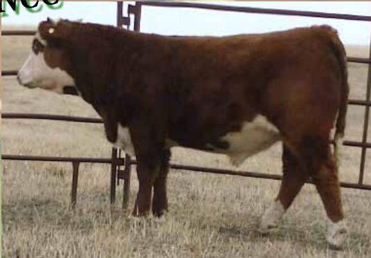
HH Time Domino 1317 - BD: 2-11-13