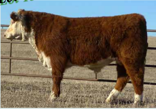
HH Mischief Rambo 1340 - BD: 3-18-13